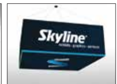
3D Shapes With Bottom Graphic