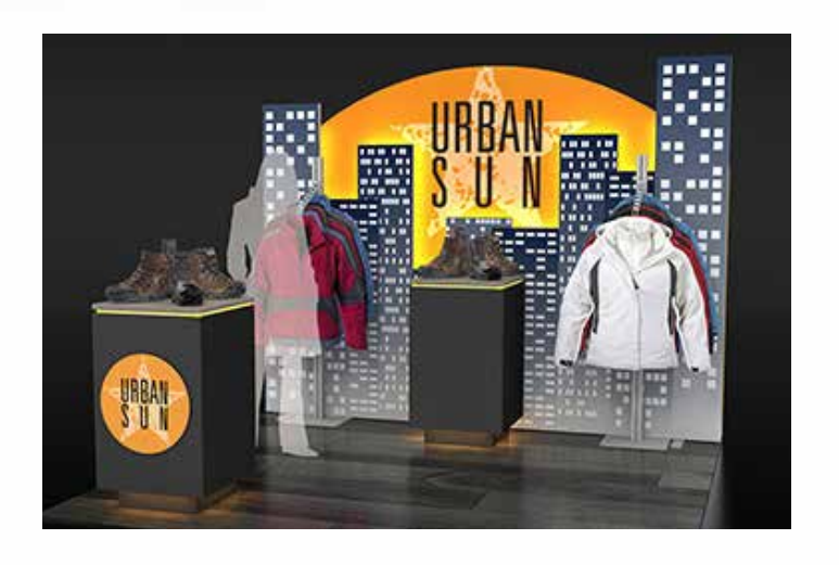
Exhibit infrequently? Rent your exhibit hardware now and leave future design possibilities open. Or rent additional components for a larger presence at your major show.